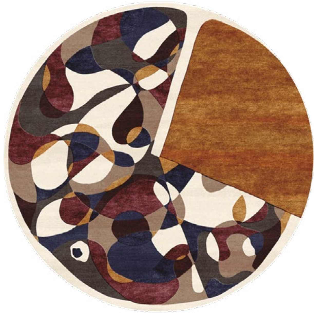
TIME CAPSULE | LIGHT